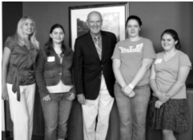
Richard Peck meets with the current Teen Advisory Board.

Libraries and Friends working together can make dreams come true.